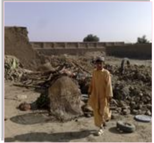
A boy stands at the site of suspected U.S. drone strikes in the Janikhel tribal area in Bannu district of North West Frontier Province.

As far back as 1982 Israel used drones against Syria. In the early nineties Israeli drones were used in the Kosovo campaign. The Israeli Air Force invades the skies over Lebanon and patrols occupied West Bank and besieged Gaza with drones. Twenty-nine civilians, including eight children, were killed in what appeared to be six missiles by drones in Gaza. In Beirut, Lebanon an Israeli drone fired and killed at least 6 civilians and wounding 16. Israel refuses to confirm whether it is using armed drones over Gaza.